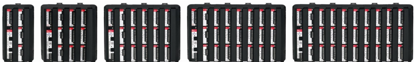
ROC827L (with 0, 1, 2, 3, and 4 expansion I/O backplanes)

The ROC800L uses a power input module to convert external input power to the voltage levels required by the ROC800L's electronics. Two power input modules are available for the ROC800L: one for 12 volt dc input power and one for 24 volt dc input power.