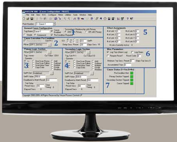
Cause Configuration for FloBoss 107

The Gas Control Manager supports Cause & Effect-oriented interlock and permissive logic, typically defined on a Cause & Effect Logic Diagram. Designed for smaller applications associated with gas control, the embedded Cause & Effect function supports up to 16 causes and 8 effects. The Gas Control Manager allows the configuration of ROC800-Series and FloBoss devices to do logical operations without writing FSTs. A Cause would typically monitor a selected point that would be logically evaluated against a user defined set-point. Any tripped Cause linked to an Effect will force the action defined in that Effect. The layout of the configuration screens defines the logic by inputting entries from a Cause & Effect matrix. In many cases, the user can input the Causes & Effects line by line through the entire matrix. Each Cause configuration screen and Effect configuration screen will apply to a tag line in the user's Cause & Effect matrix.