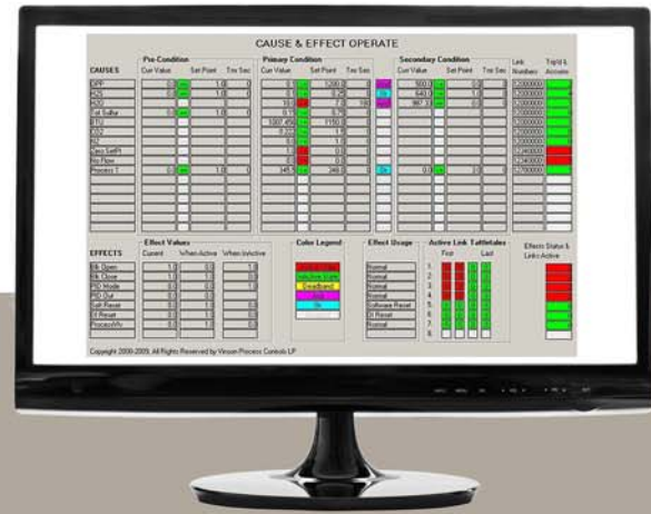
Causes & Effect Operate Display