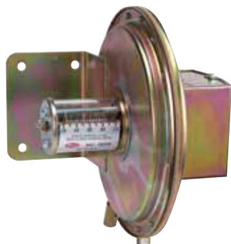
Model 1640 null switch.