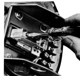
Adjusting the "null".

The Model 1640 Floating Contact Null Switch is identical to Dwyer® Series 1630 Large Diaphragm Pressure Switches, except for its electric switch. Model 1640 is equipped with a single pole, double-throw floating contact switch (not snap action), so it functions as a null switch.